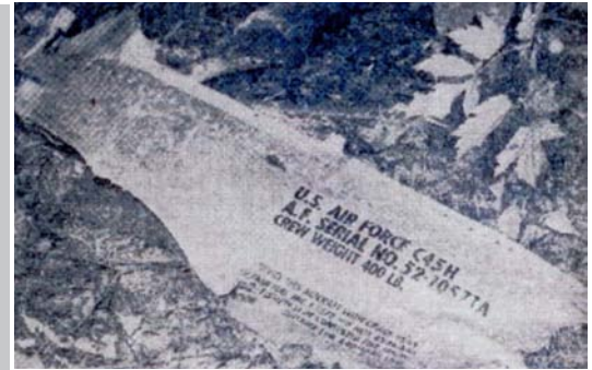
Many local residents have summited Pond Knob to hunt for relics of the crash, like the one above.

The story told at the time of the tragedy was that the woman had crawled some dis-