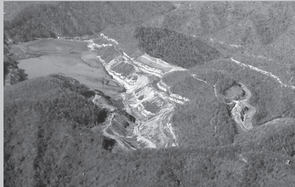
Blasting begins on the edge of the Brushy Fork sludge dam.

As a native West Virginian and a long-term resident of the Coal River Valley, I am very concerned about the current activity by the coal company on Coal River Mountain. My property borders Coal River Mountain, and so does many of my family, friends and neighbors. For the past 19 months we have worked very hard to save this mountain from destruction. We are supported by over 13,000 people from across this nation including many residents of this state.